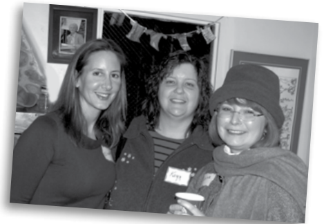
Friends and Fun at the 2008 Party

Come chat with your neighbors, old and new, enjoy your wonderful community – we might even drum up a Jingle Bells! If you can contribute anything, a quiche or a pie, fingerfoods, cookies, anything, please email social@beverlyglen.org or call Elke at 818-448-0277.