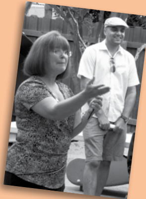
At the Annual Meeting