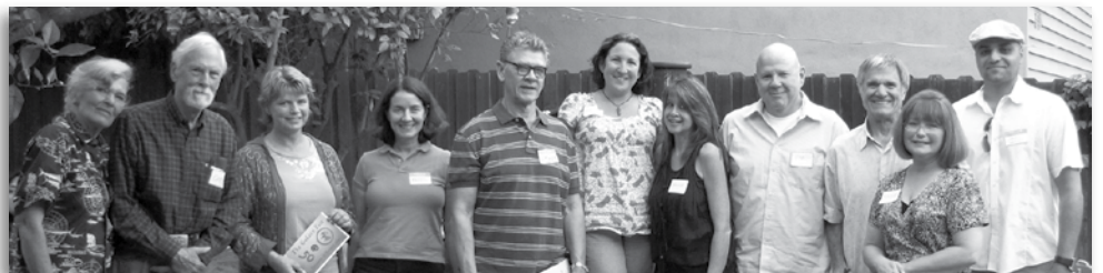
The new slate for 2010-2011