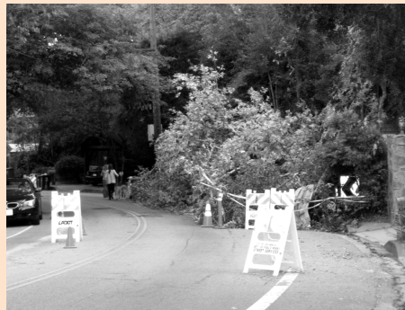
Trees down across the Blvd. at the Four Oaks