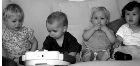
Future Playgroup kids hanging out in the Glen

the street has evolved into a standing Friday afternoon "Mommy and Me class" — Beverly Glen style. Every week at a different house. The group is now up to six moms and tots, with the spirit having spread onto the neighboring street of Chrysanthemum where others (including