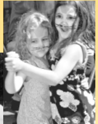
Two cats having fun dancing to the rhythm of the belly dancer.