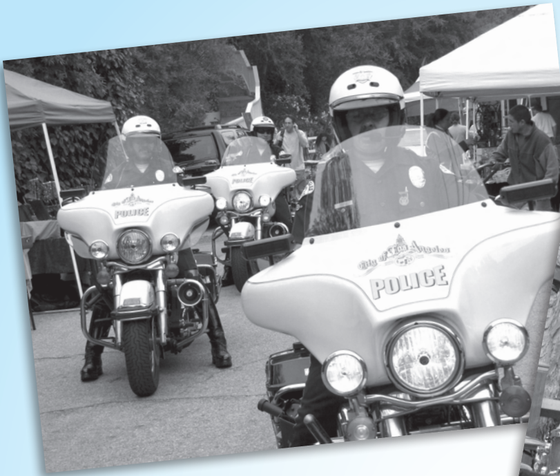
Our police guests arriving