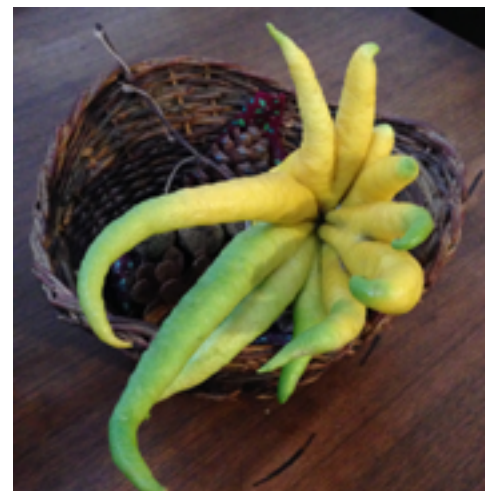
BG Farmers Market Buddha’s Hand waiting to grace my Thanksgiving table

As a lover of freshly harvested faire and farmers’ markets, and a believer in buying locally and supporting small farmers, I am thrilled to have a farmers’ market so close to us in the Glen. Even so, I have not yet fully adjusted my mental calendar to associate Saturdays with shopping there and am sad when I have missed the opportunity. If you haven’t yet visited our local farmers’ market, I encourage you to do so. Take advantage of the (free) valet parking, and be sure to bring several, large shopping bags... you will fill them!