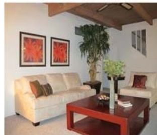
1965 N Beverly Glen Blvd List Price $895,000 May 2013