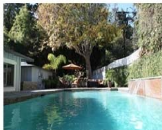
2085 N Beverly Glen Blvd List Price $1,325,000 February 2013