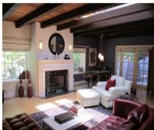
2426 N Beverly Glen Blvd List Price $835,000 April 2013