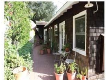
10491 Selkirk Lane Sold Over Asking $611,000 March 2013