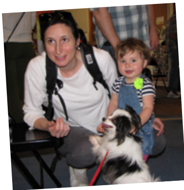
Ready to Go!