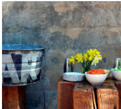
Still life with food at the Millers'