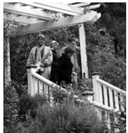
A garden full of smiles